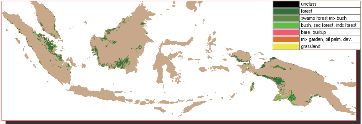
Figure 1 Land cover in the Tropical Peat Soil Area